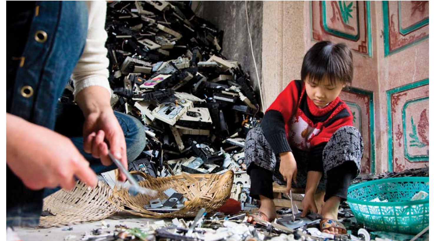
OLD COMPUTER COMPONENT 'PROCESSING'

You're not destroying the Earth with paper